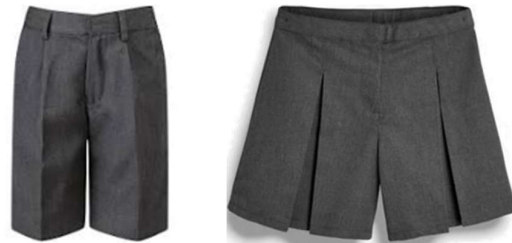
Smart tailored shorts or skorts (grey or black)