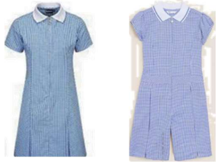
Blue and white checked summer dress